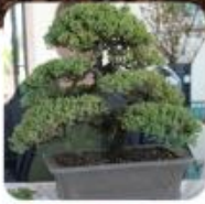
Members Trees @ the Meeting