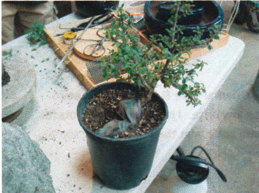
Rest in Peace little tree. We hardly knew you