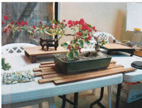
Pebble tile (left) & offset slats of wood (right) Note the various stands in rear