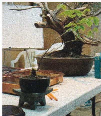
Even a candle holder can work

Please Note: Please bring the trees you are thinking of displaying to the May meeting. At the meeting we will be able to provide a helpful critique for final styling or display ideas. This is our first show. We will have trees that are quite advanced in age and technique as well as trees that reflect that some of us have trees that we have only styled in the last year or even this year. Our hope is that the show helps stimulate interest in Bonsai to people of all levels of skill and experience and even encourages some to try it for the first time!