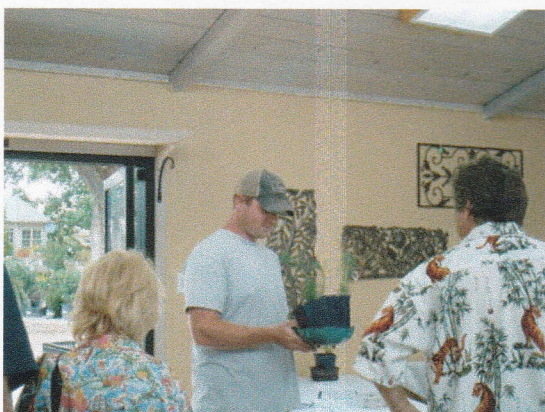
Door Prize Drawing Winner – A Starter Tree and Pot