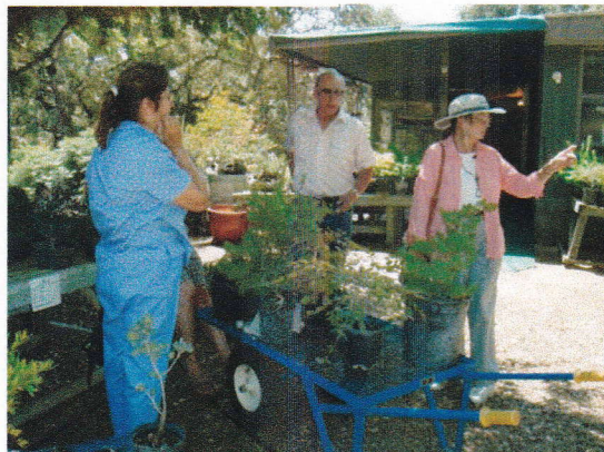
Hey, I don't have one of those