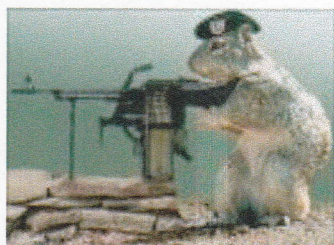
An old friend of Charles provided security