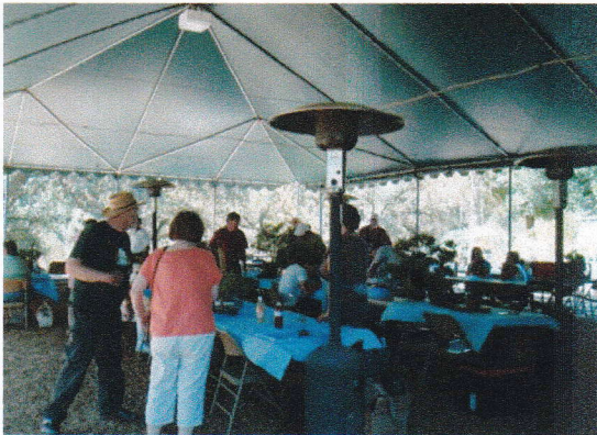
The Modesto Club meets in a tent at the Nursery with lots of tables for people to work on their trees