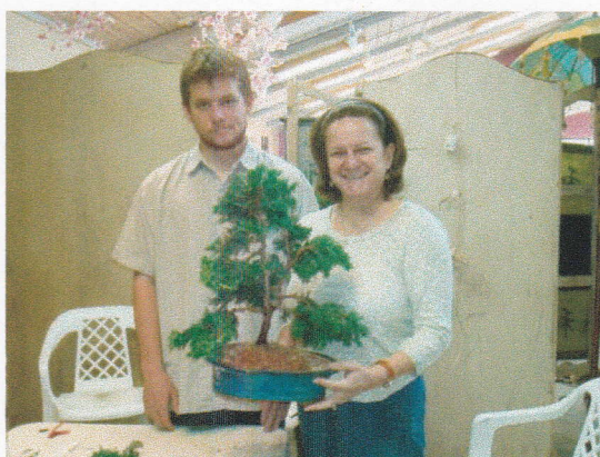
Lucky Raffle Winner and Her Prize!