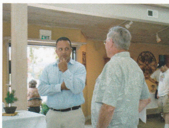
Big Thoughts.....Small Tree