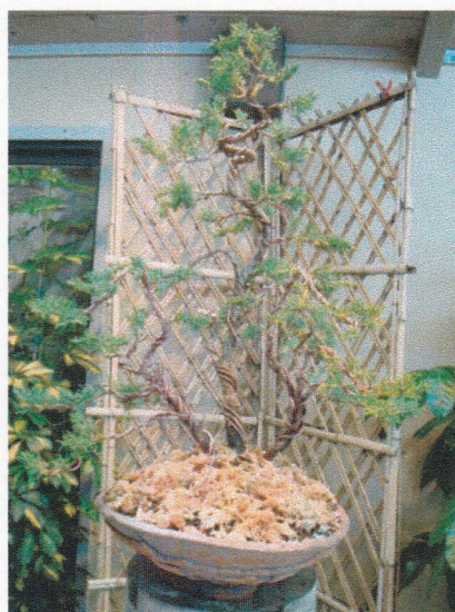
The Most Coveted Tree at the Show Won By Neema!