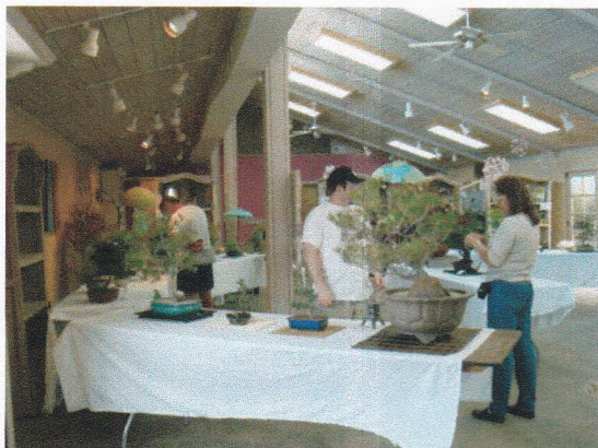
Plenty of Trees Were on Display