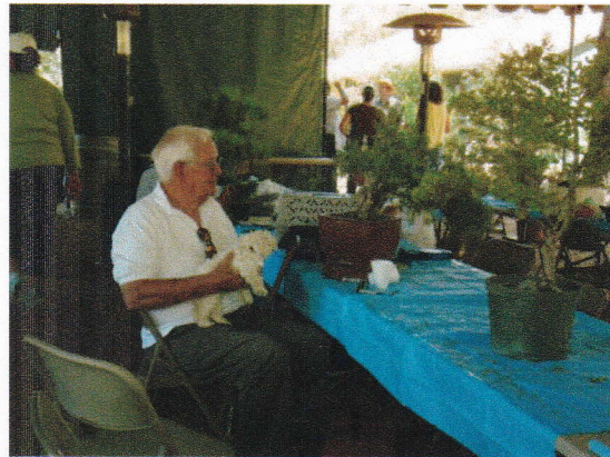
A man, his dog and his trees, life's good!