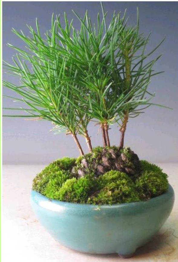
Japanese Black Pine mini bonsai by Vertmoi

5. If you want to grow the seeds directly from inside the pinecone you will next place your pinecone in your prepared soil. Loosely bury bottom of pinecone only, do not bury the entire pinecone! From this point you will water it sparingly and wait for it to sprout - do not over-water or it will rot. That is all there is to it!